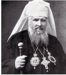
The Servant of God Metropolitan Andrey (*July 22, 1865 - +November 1, 1944)

The Metropolitan lay calmly with eyes shut and breathed with difficulty, as he had previously. Then he began to pray again. He opened his eyes and began to talk to us: