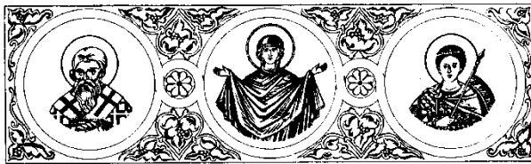
Feast of the Protection of the Mother of God October 1

Sincere thanks to all for your kindness and generosity to our Holy Church!