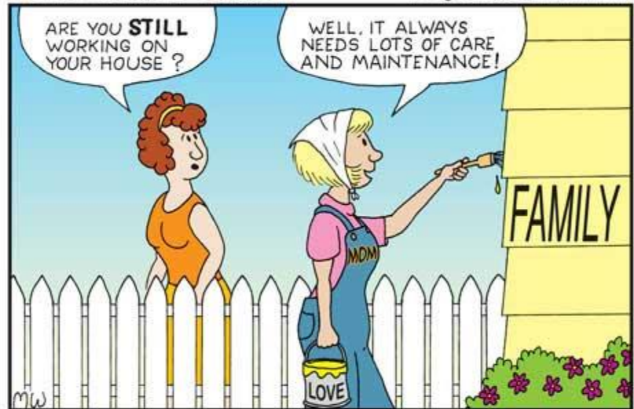
The wise woman builds her house, but with her own hands the foolish one tears hers down. - PROVERBS 14:1 NIV