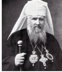
The Servant of God Metropolitan Andrey (*July 22, 1865 - +November 1, 1944)

The Metropolitan lay calmly with eyes shut and breathed with difficulty, as he had previously. Then he began to pray again. He opened his eyes and began to talk to us: