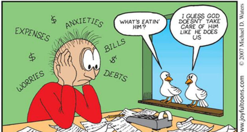
Look at the birds of the air; they do not sow or reap or store away in barns, and yet your heavenly Father feeds them. Are you not much more valuable than they? Who of you by worrying can add a single hour to his life? - MATTHEW 6:26-27 NIV