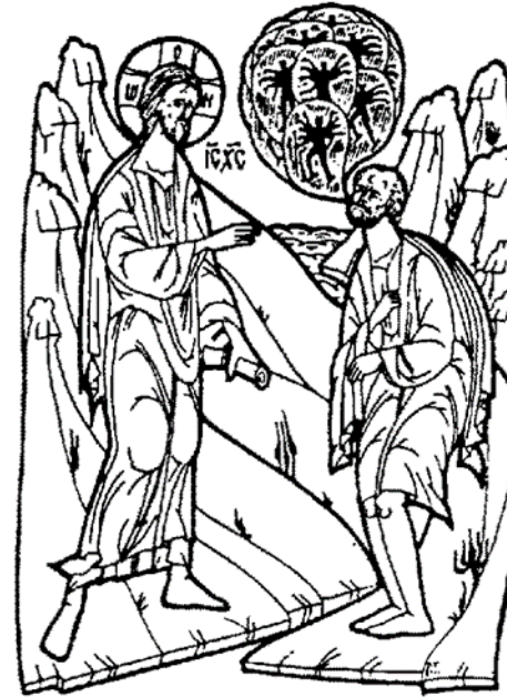
·:JESUS EXPELS THE DEMONS·:

Please, remember to turn your clock 1 hour back next Saturday, November 4th, 2023 before you go to bed.