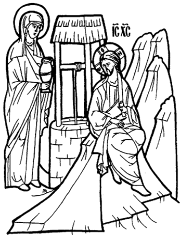
THE SAMARITAN WOMAN